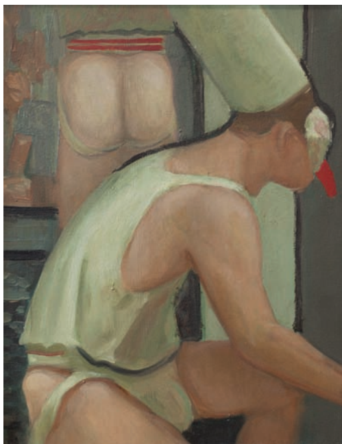
Locker Jock III 1999 14 X11 o/c