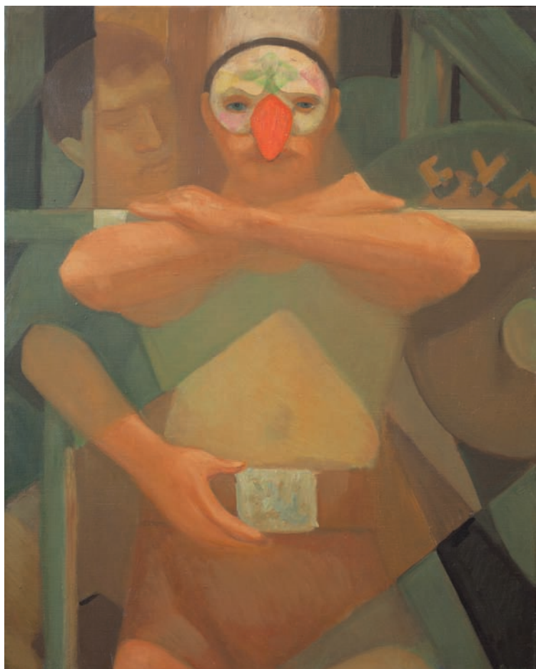
Succor III 1998 30X24 o/c