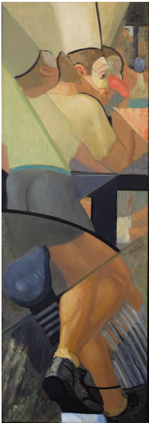
Spinning 1997 46X16 o/c