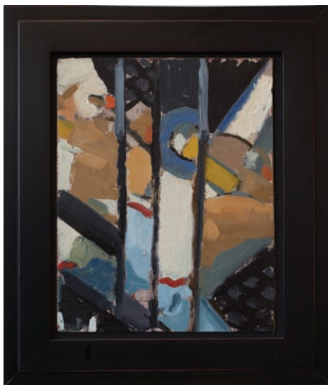
Metamorphosis 1997 16X12 o/c