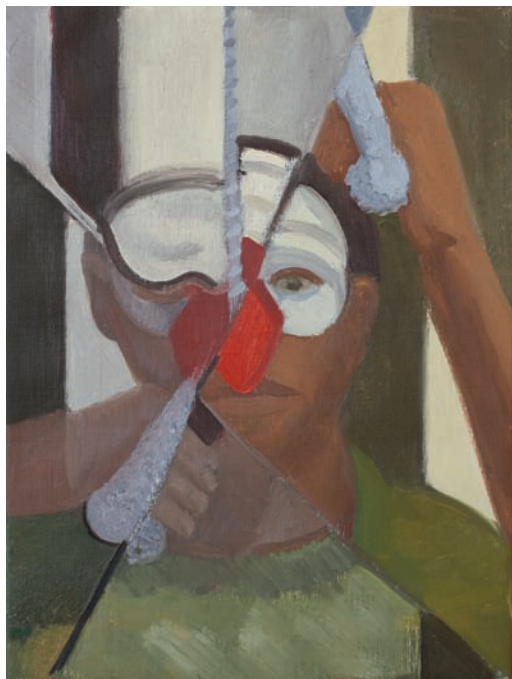
Green Portrait 1997 16X12 o/c