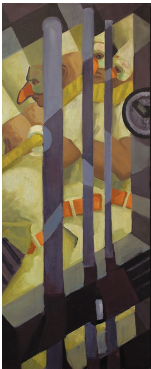
Flux 1996-7 39X16 o/c