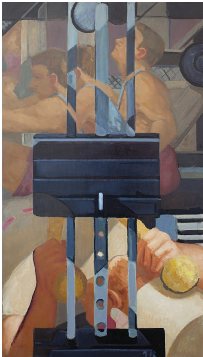
Supplication 1996-7 46X26 o/c