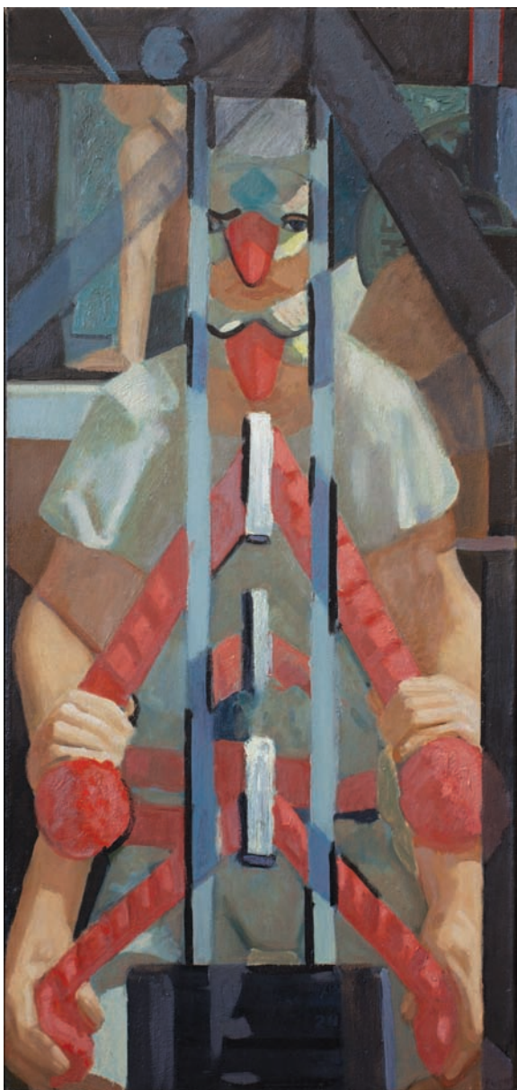
Push Down 1999 34X16 o/c