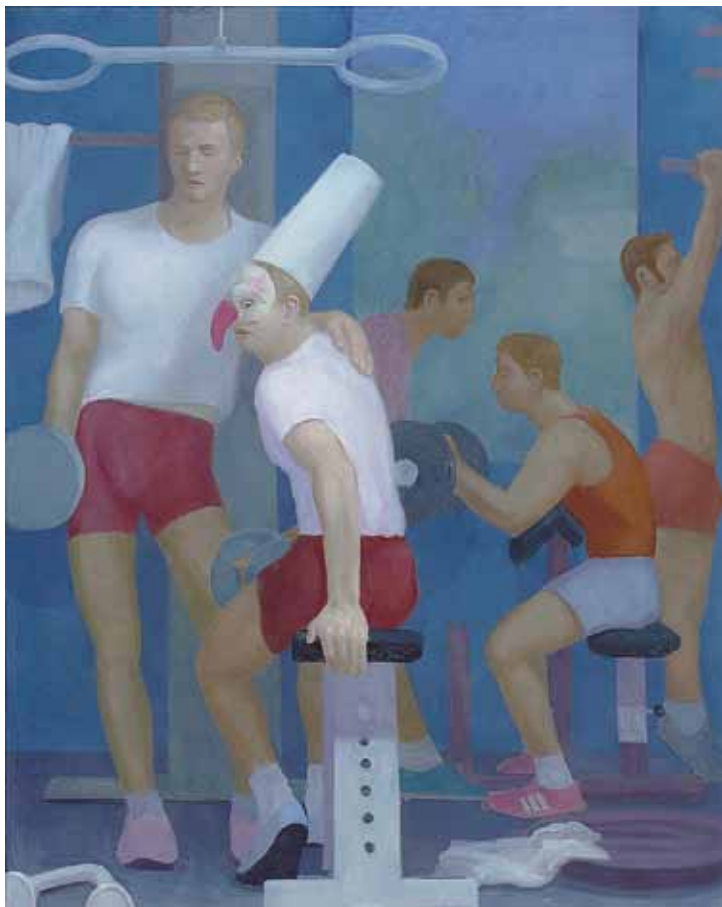
Love 60 X48, o/l, 2008-10