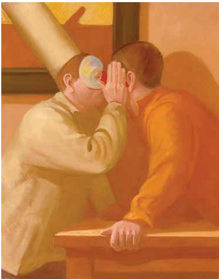
Married Life: Secret 40 X32, o/l, 2007-10