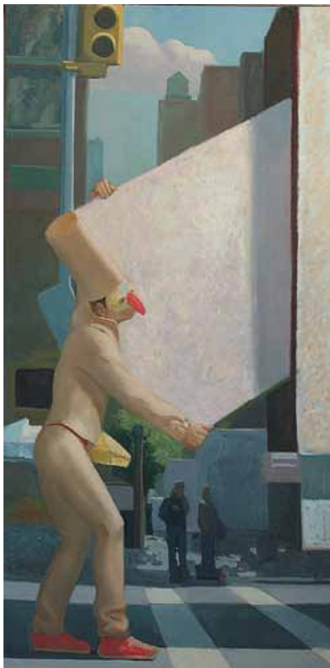
Punchinello Unloads I 72X36, o/l, 2007-9