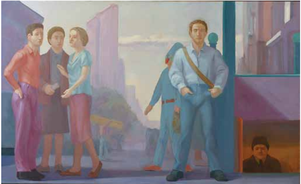
Punchinello As Leporello 48 X78, o/1 , 2006-10