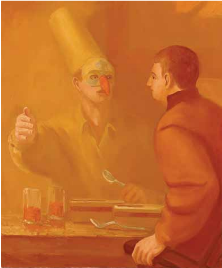
Married Life: Breakfast 36X30, o/l, 2007-10