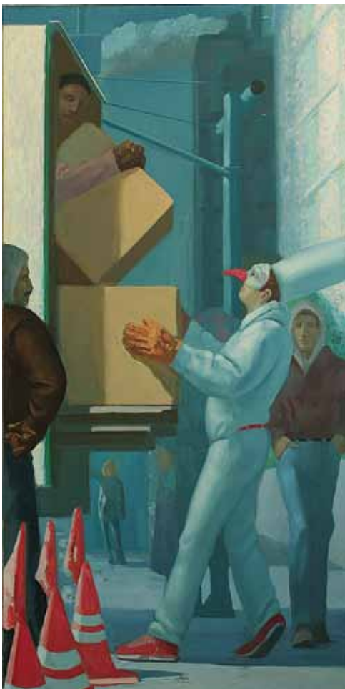
Punchinello Unloads I I 72X36, o/l, 2007-9