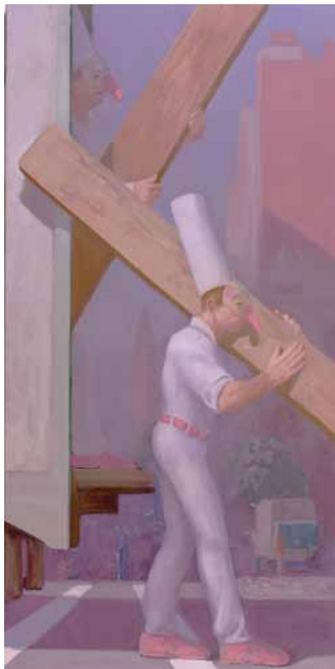
Punchinello Unloads III 72X36, o/l, 2008-10