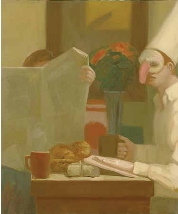
Married Life: Sunday Brunch 36X30, o/l, 2007-10