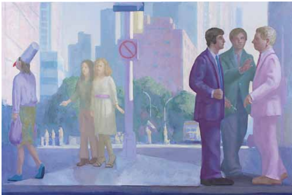
Punchinello As Despina 48 X72, o/l, 2007-10