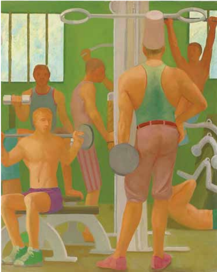
Solitude 60 X48, o/l, 2008-10