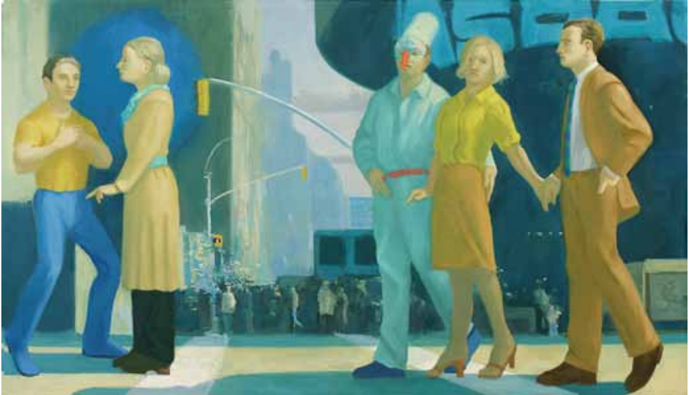
Punchinello As Figaro 48X84, o/l, 2007-10